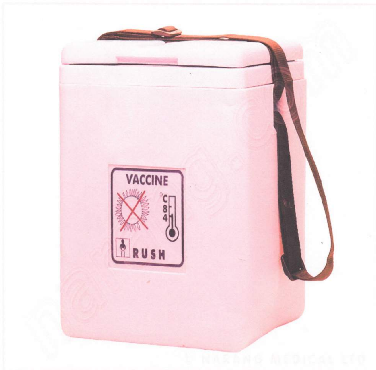
VACCINE CARRIER COLD CHAIN BOX