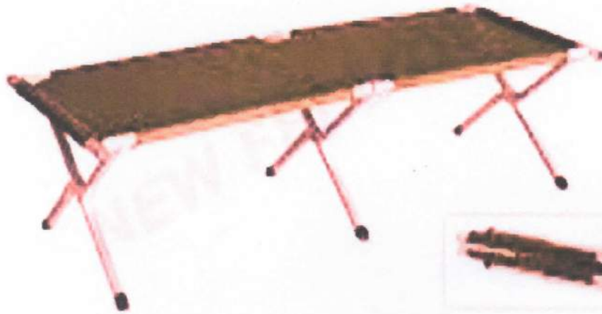
MILITARY EMERGENCY FOLDING STRETCHER, Double folded bed Oxford leather Foldable, High storage ALUMINUM ALLOY Color " Army Green"