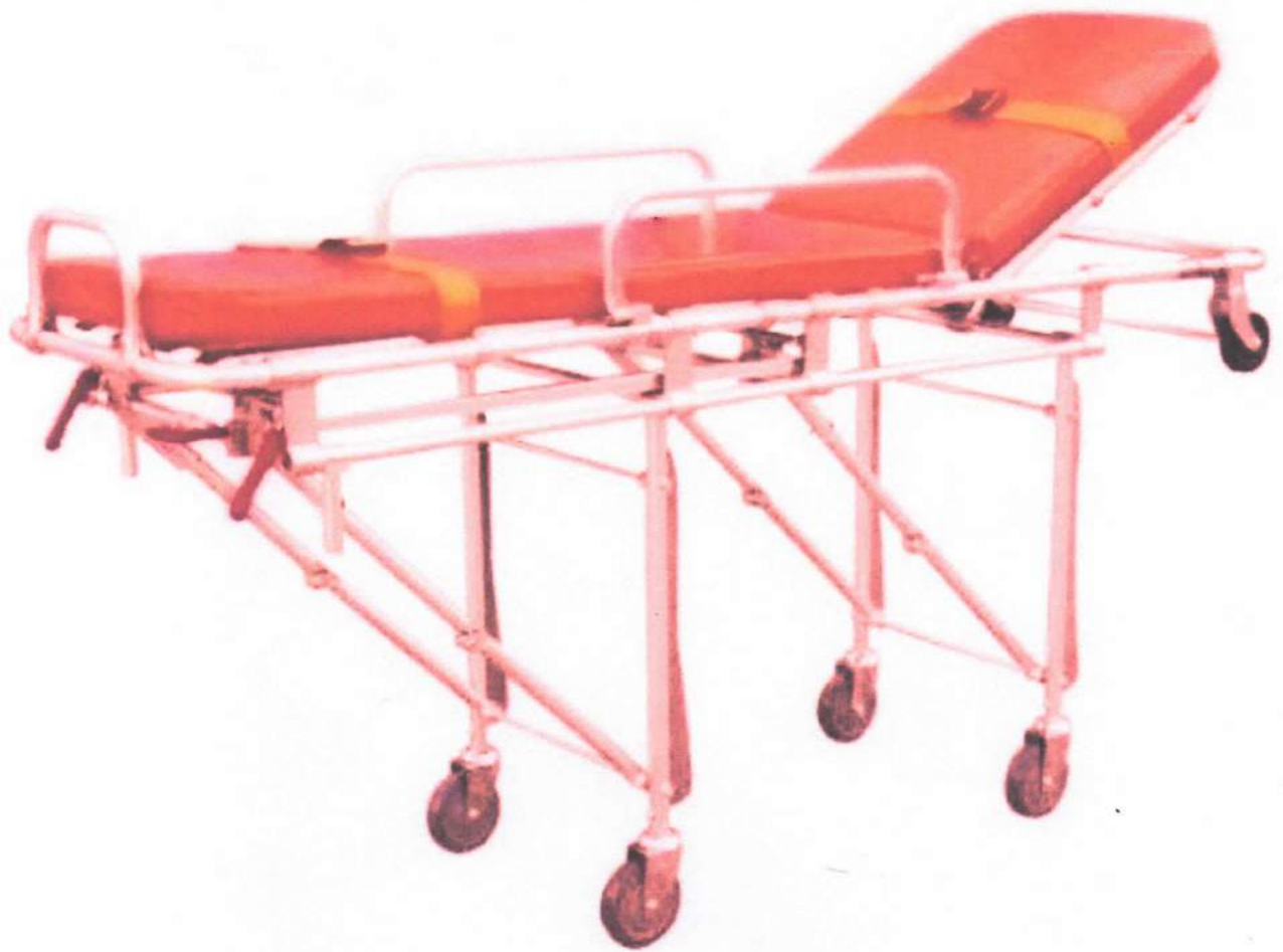
COLLAPSIBLE AMBULANCE STRETCHER, AUTOMATIC LOADING