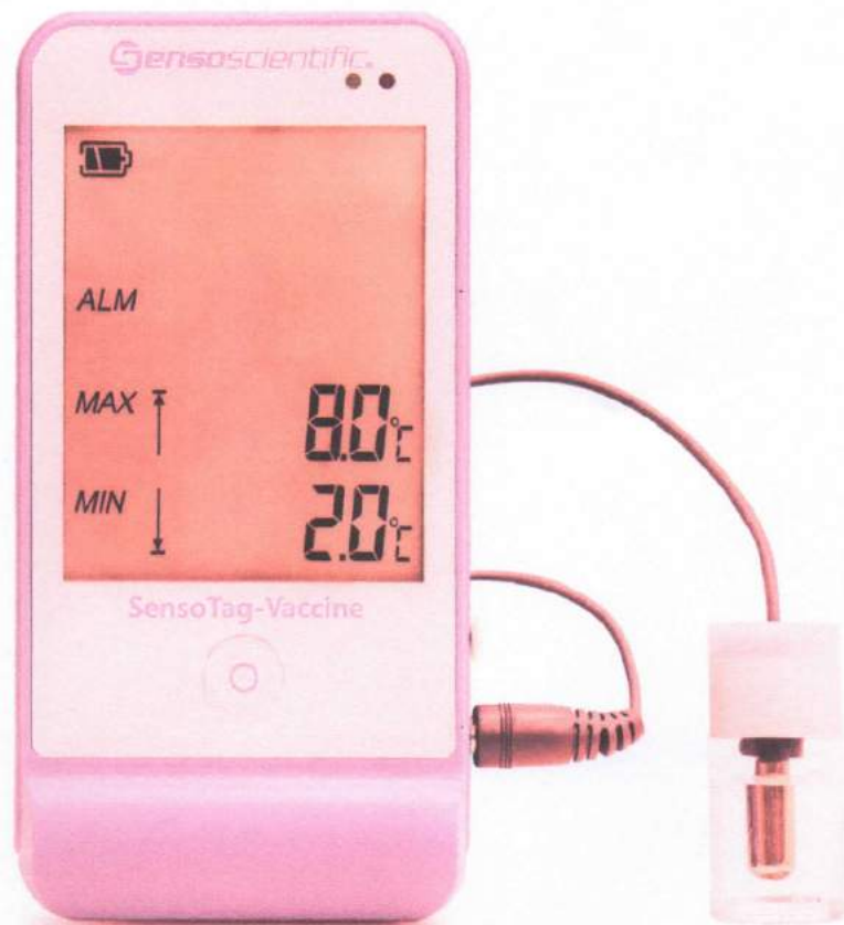
Vaccine Thermal Monitoring Device